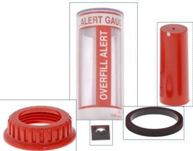
OF Repair Kit