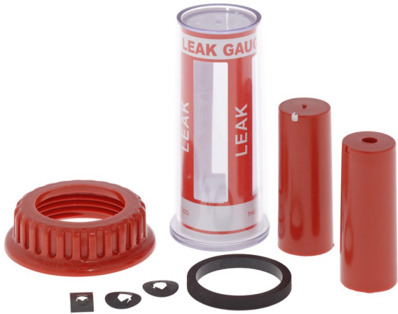
K Repair Kit