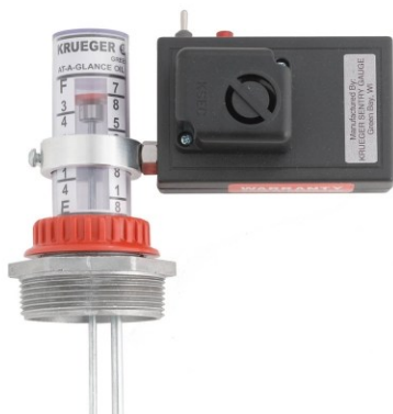
Flashing Light Version