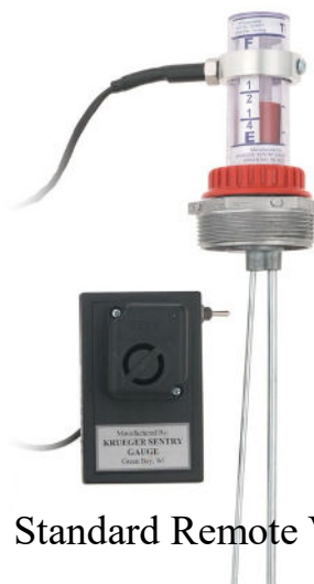
Standard Remote Version

Krueger Sentry Gauge 1873 Siesta Lane Green Bay, WI 54313