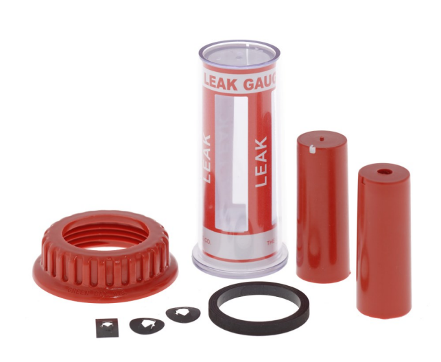
K Repair Kit