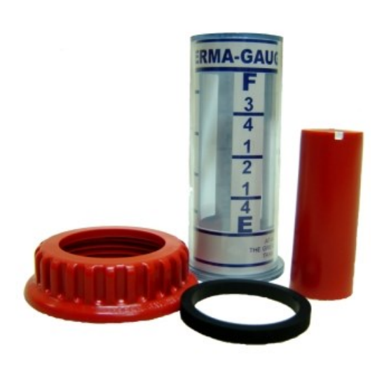
H Repair Kit