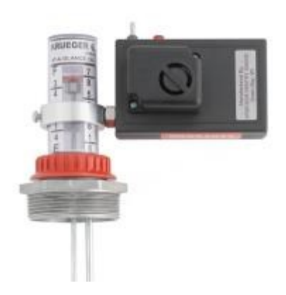
Flashing Light Version