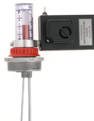
Direct Mount Alarm

Glass Calibration- The internal piece of the calibration becomes glass. Provides protection from heat, fumes, weathering, and also helps with passing fire inspections. (part # add -GLC)