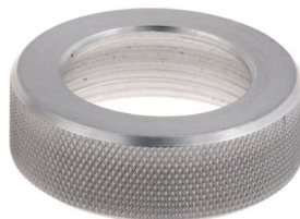
Aluminum Lock Nut