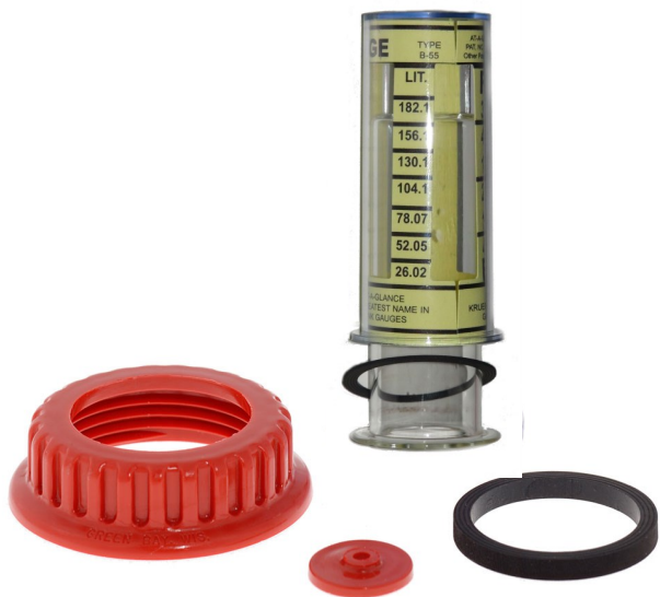
B Repair Kit