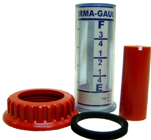
H Repair Kit